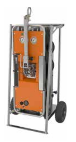
EASY TO TRANSPORT Optional